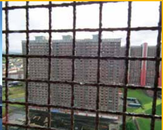
View from Red Road Community Flat