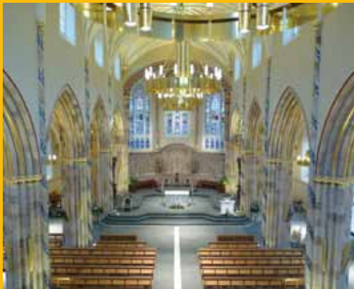
St. Andrew's Cathedral