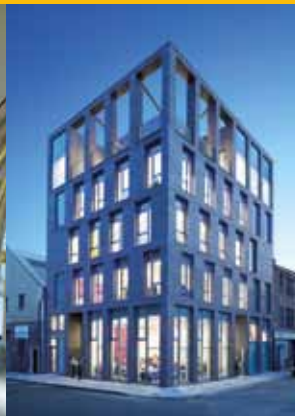
Glasgow City Mission